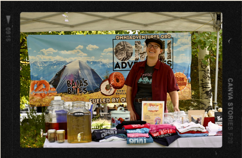
CANVA STORIES F20