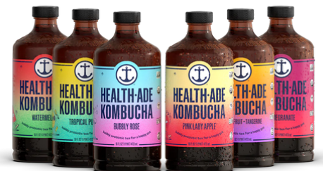
Health-Ade Kombucha 16 fl oz, all flavors