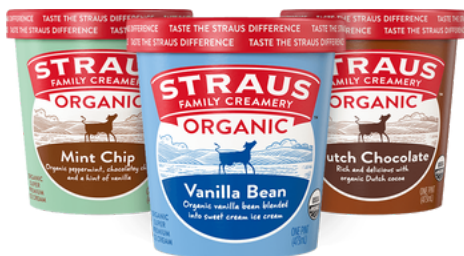
Straus Creamery 473mL, all flavors