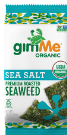
gimme Seaweed Snacks .32 oz, all flavors