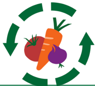
TABLE to FARM COMPOST

Being a Cooperative makes Durango Natural Foods unique. While most store's membership ends at discounts, our members directly own the store and shape its future. Please vote in the upcoming election. Your vote, your equity, and your shopping trips will help shape our work to promote democratic governance, equitable fundraising, sustainability, and healthy food.