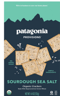
Patagonia Crackers 4.4 oz, all flavors