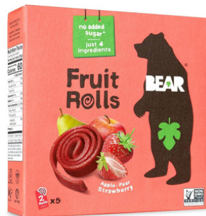
Bear Fruit Rolls 3.5 oz, all flavors