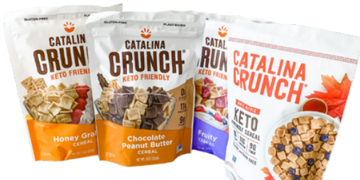
Catalina Crunch 9 oz., all flavors